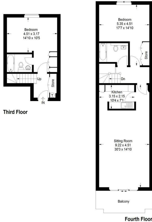
Illustration for identification purposes only, measurements are approximate, not to scale. FloorplansUsketch.com © 2014 (ID115918)

Approximate Gross Internal Area = 103 sq m / 1109 sq ft